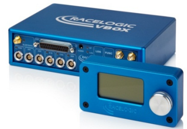
VB3iSL-RTK with VBOX Manager

Increasingly, improvements in vehicle performance are tied with the need to satisfy the demand for safer motoring. Manufacturers have to develop and test a greater number of vehicle enhancements and safety features, and their engineers need an accurate and practical method to verify performance.